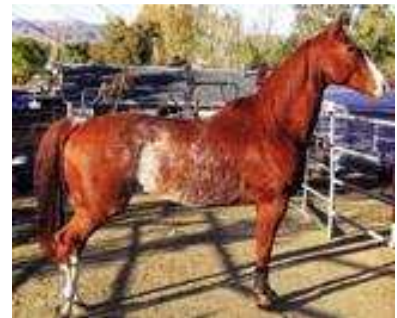
Extra Special Cash, owned by Susan Carlile of Sparks, Nevada, is a classic rabicano.

The easiest way to tell the difference is to remember that rabicano always affects the base of the tail, while sabino does not. Sabino does, however, almost always involve facial white with a spot of white on the chin and socks on the legs, in addition to the body roaning. It is possible for the horse to carry multiple genes, for example, to be both rabicano and sabino. Rabicano is not an official AQHA colour, but rather a marking that can be noted on a horse's registration certificate.