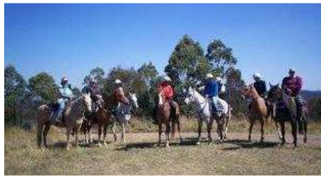
SOME OF OUR RIDERS