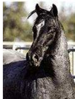
Blue Hurricane, owned by Frances Robertson of Bend, Oregon, is a blue roan.

The winter coat is different in that the base coat will grow longer, but not the roan hair, while a rabicano will appear the same in the summer and winter. Foals in the early stages of going gray are often confused with roan. A foal turning gray will usually have gray hairs immediately surrounding the eyes and muzzle and on the backs of the ears, as well as on the body. It is possible for a roan horse to also be gray if it has gray and roan parents. It will begin life as a roan and then gray out as it ages.