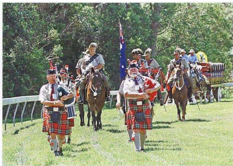
TUNCURRY RACE DAY 2