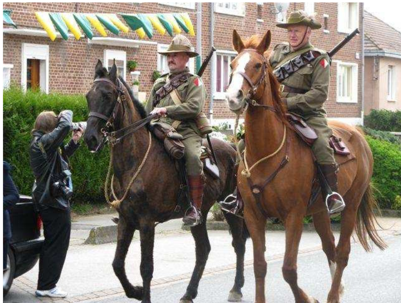
ANZAC DAY VILLERS-BRETONNEUX 2008